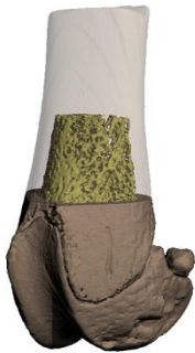
Three-dimensional reconstruction of rat femoral structure.