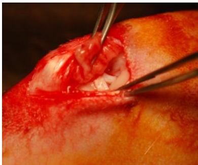
Transection of the anterior cruciate ligament to induce OA in a rabbit model.

Surgical models use a variety of methods (e.g. ACL transection, meniscal tear, meniscectomy) in small and large species to induce joint instability. While etiologically similar to human secondary OA, the resulting lesions also resemble primary OA. Depending on the model, lesions may be more reproducible, more rapidly induced, or more severe than in the spontaneous models. The chosen model should be carefully selected to match the expected therapeutic result.