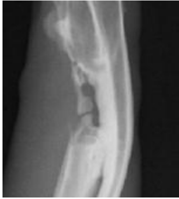
Radiography of New-Zealand White (NZW) rabbit ulna critical-size defect.