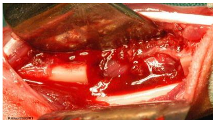
New-Zealand White (NZW) rabbit ulna critical-size defect.